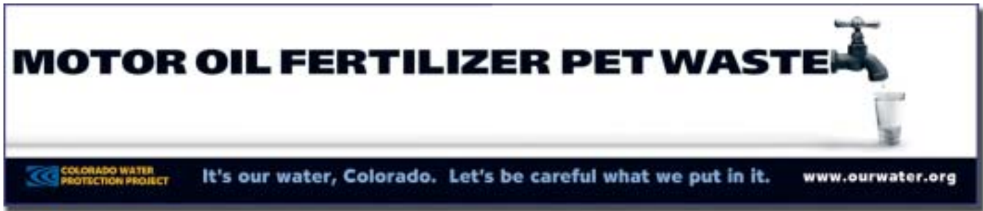
Denver RTD Bus Signs