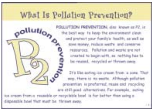
Pollution Prevention Tool Kit

awareness of nonpoint source issues and the impacts individuals could have on reducing pollution. The project was less successful in increasing the awareness of how pollution reached streams, rivers and lakes.